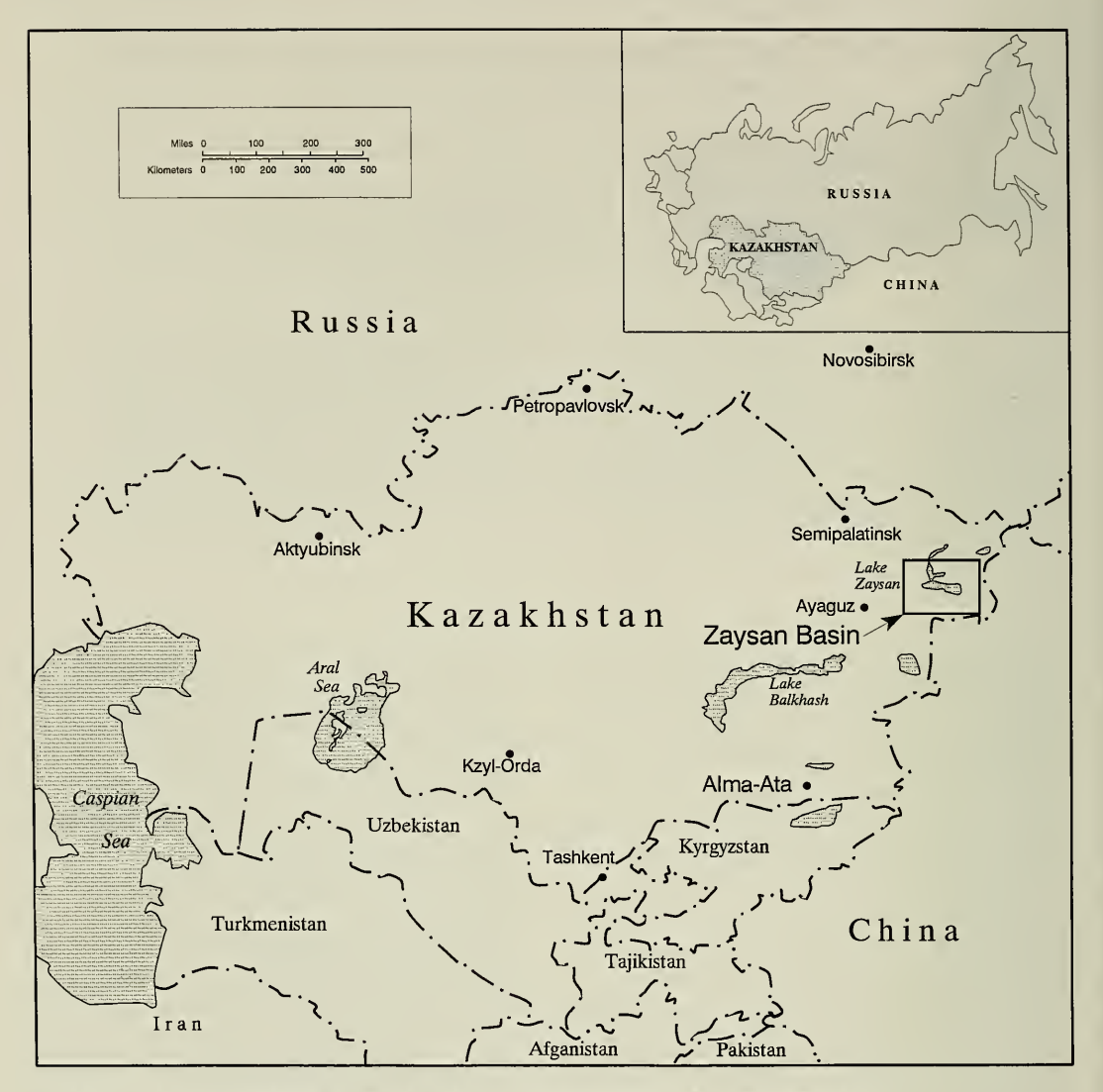
Fig. 1. Map of Kazakhstan showing location of Zaysan basin in the northeastern part of the country.

crown forming sharp, nearly parallel carinae extending almost to root. No lateral cusplets preserved, but crown base is missing where these would have been, if present at all. Crown enamel lingually smooth to very weakly striated longitudinally. Impossible to determine if root had transverse groove. Lingual face of root smooth and convex. Root not massive, but full extent cannot be determined.